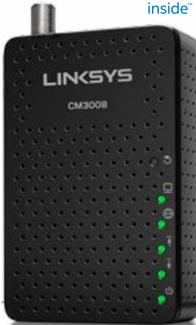
MODEM Converts data to Ethernet