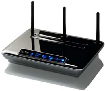
All Belkin Modem Routers

This Guide refers to the following Products: